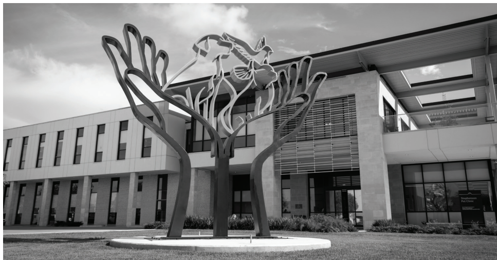
The LSU School of Veterinary Medicine installed a stunning sculpture titled, "In Our Hands" by DiBari & Associates. The sculpture is prominently positioned in front of the Stephenson Pet Clinic. Funded by the Percent for Art Program under Louisiana's Division of the Arts, Office of Cultural Development, this artwork symbolizes the school's commitment to the wellbeing of animals and people alike.