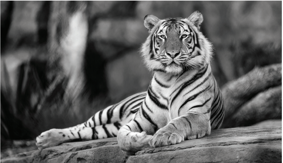
Mike VII is the only live tiger mascot in the U.S. LSU got its first live in tiger in 1936. The LSU School of Veterinary Medicine provides the daily and veterinary care for Mike. LSU's attending veterinarian is a member of the LSU Vet Med faculty, and Mike's daily care is provided by two veterinary student caretakers who work in the role for two years.

For a full listing of the scholarships administered externally for the academic year, please visit the TEAMS channel where all external scholarship opportunities will be posted.