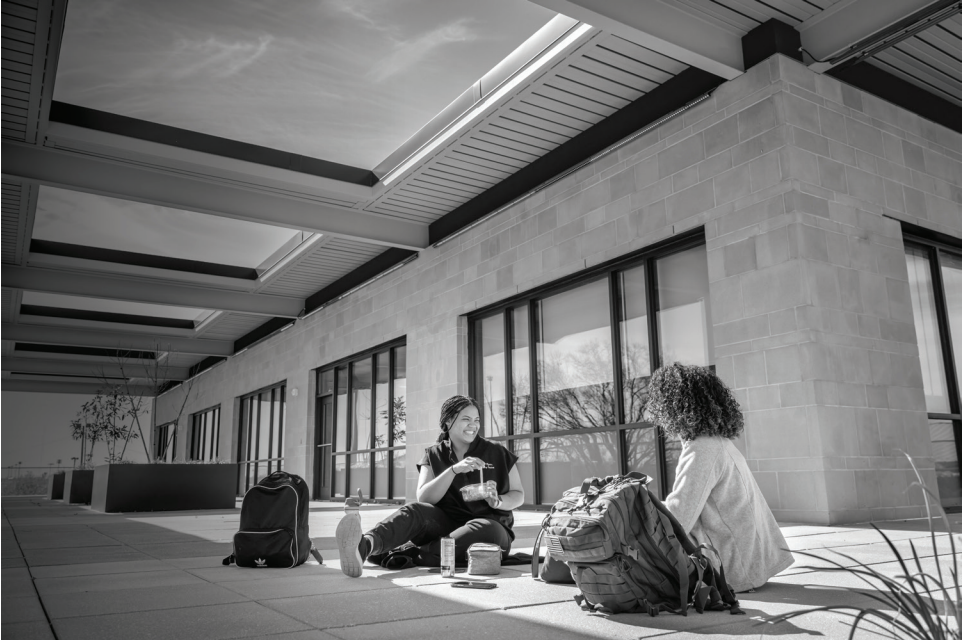
The Stephenson Pet Clinic Terrace is a great place to hang out, study, visit with friends, and enjoy a great view.