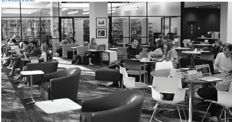
We Teach: The LSU Veterinary Medicine Library is accessible 24/7.

All fees are estimates and the LSU Board of Supervisors may modify tuition and/or fees at any time without advance notice. Check current tuition and fees at www.lsu.edu/bqtplan/Tuition-Fees/fee-schedules.php .