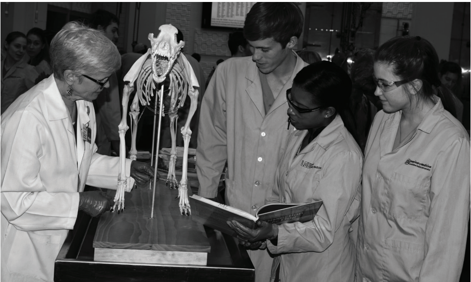
We Teach: First-year students spend up to 10 hours a week in anatomy lab.

5163 Form and Function 3 (3.5) Form and Function 3 will provide additional knowledge base in microanatomy, physiology, and gross anatomy from both a systems and a comparative perspective. The main goals are to solidify a knowledge base in how organ systems normally work for most species, and to explore normal clinically relevant microanatomy, physiology, and gross anatomy, demonstrating an application of that knowledge in various large animal, avian, and alternative species. Form and Function 3 will cover the musculoskeletal system and the nervous system using