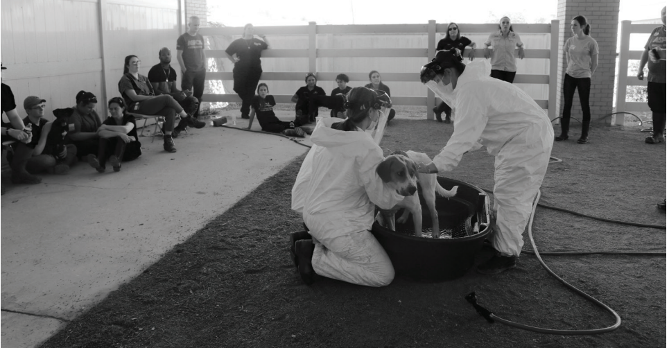
We Protect: The LSU School of Veterinary Medicine conducts disaster response training. Here, animal first responders are taught to decontaminate animals following a disaster. The LSU School of Veterinary Medicine's disaster response efforts began with Hurricanes Katrina and Rita and have continued with Hurricanes Ivan, Gustav, Isaac, and Laura; the 2010 Gulf Oil Spill, the Mississippi River flooding in Tennessee in 2011, the flooding in south Louisiana in 2016, and smaller scale rescues including vehicular accidents and flood rescues.

anesthesia recovery and post-anesthesia complications. The laboratory portion of this course will provide the student with an opportunity to develop the technical skills associated with the sedation and induction, maintenance and monitoring of general anesthesia focusing on safety, pharmacology, physiology, analgesia, and anesthetic equipment usage.